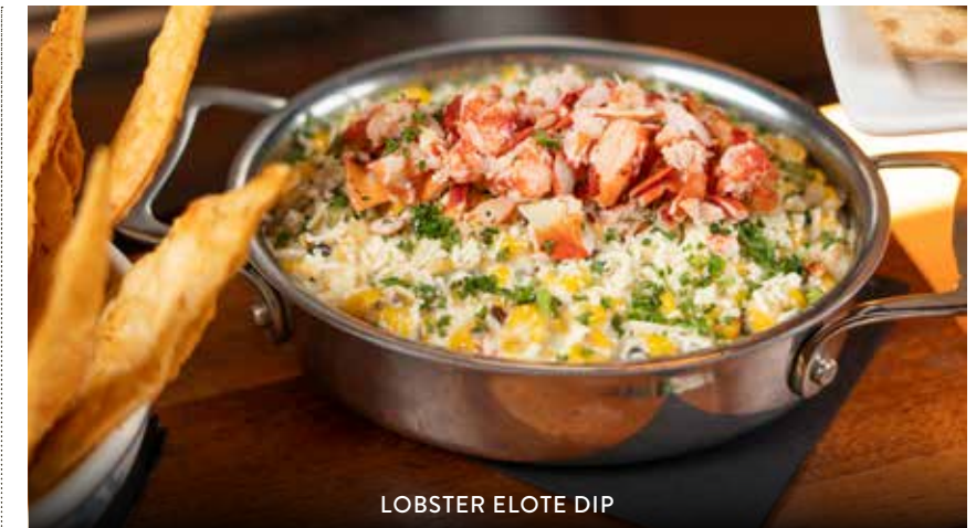
LOBSTER ELOTE DIP