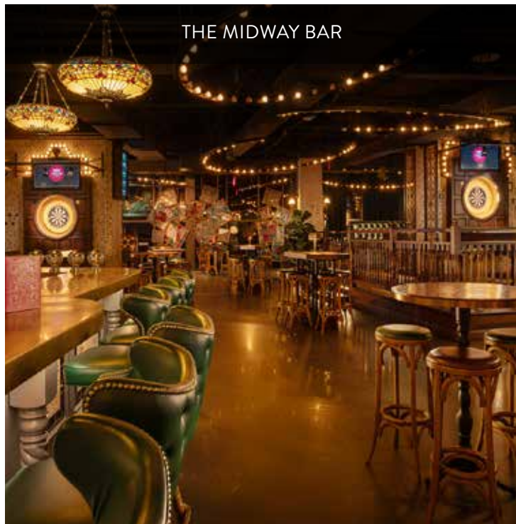
THE MIDWAY BAR