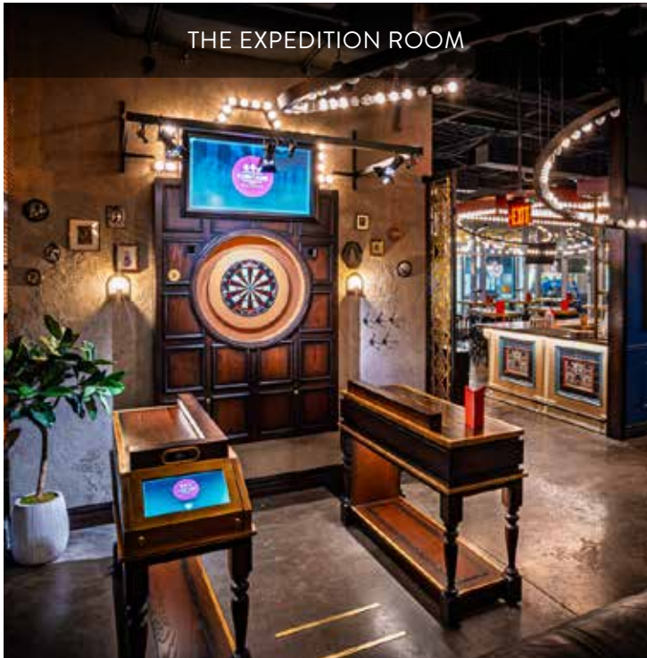
THE EXPEDITION ROOM