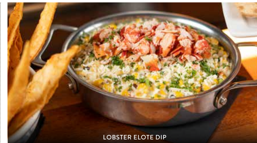
LOBSTER ELOTE DIP

DESSERT TOWER V ..... 55 Mini Lemon Tarts, Assorted Cookies, Mini Cannolis